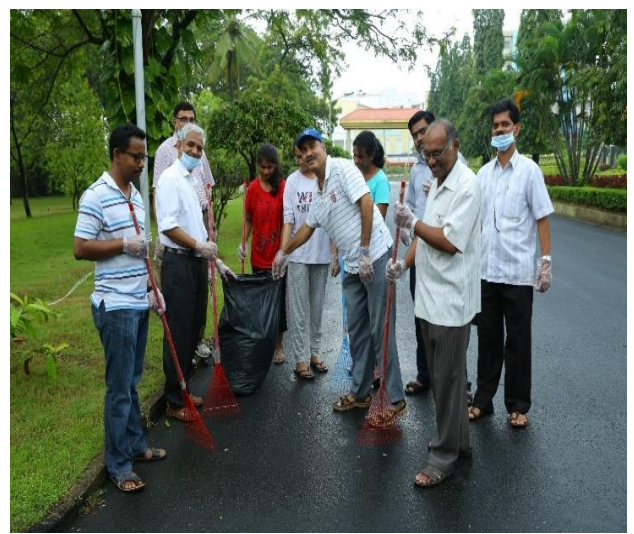
Swachhta Execution by Director

1. Swachhta Pakwada programme was conducted in the Institute from 19<sup>th</sup> August to 2<sup>nd</sup> September 2017 with various activities. The programme was started with Swachhta Pledge by students and staff. The institute started the Swachhta programme by brooming and picking dirt inside and outside the campus. Many activities like Essay Competition, Debate Competition, Poster Competition, Seminar on Recycling, Seminar on Atmospheric Cleanliness and Seminar on Noise Pollution were conducted to create awareness among the students of NITK on Swachhta Bharat Pakhwada.