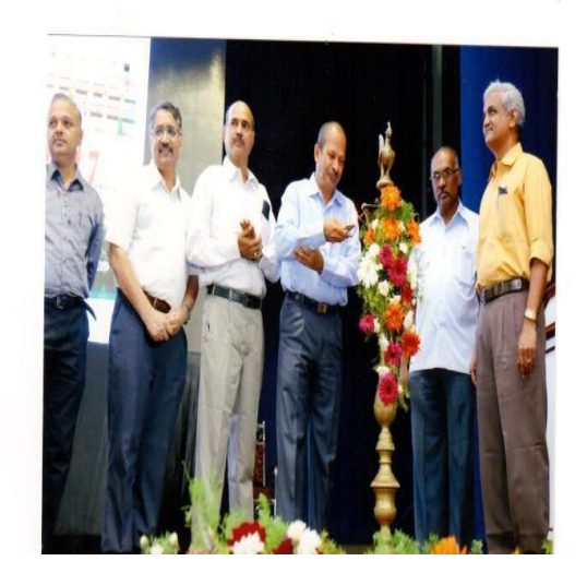
Page 22 of 31